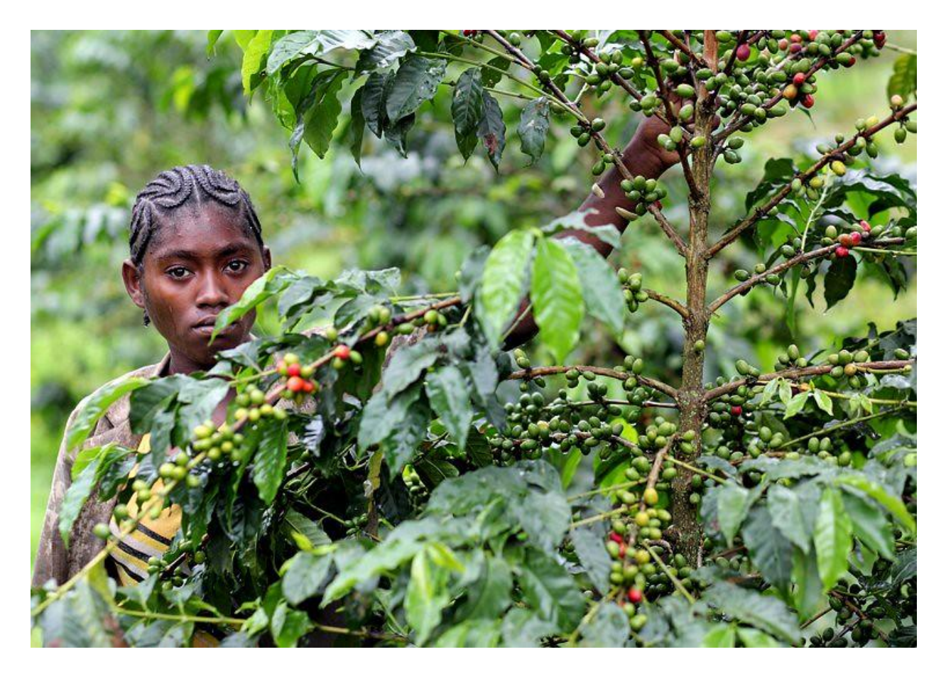
Day 05 Mizan Teferi-Kibish

In the morning continue driving to Kibish. The first part of this area is covered by dense pluvial rainy forest with different indigenous trees. The Agnuak people reside in the Dima district which is very near to Sudan. The Anuak are a river people whose villages are scattered along the banks and rivers of southeastern Sudan and western Ethiopia, in the Gambela Region.